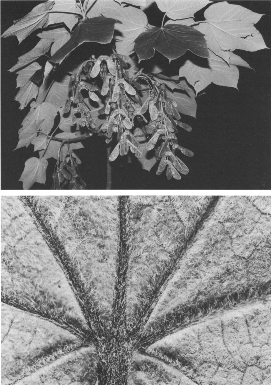
Figure 2. Acer yangbiense .—Above. Fruiting branch. —Below. Pubescence on the abaxial leaf surface.

Distribution and habitat. This species seems restricted in distribution. So far it is known only from its type locality, a valley in the western slope of Mt. Cangshan, Yangbi, northwestern Yunnan. Just above this area grows a large forest of Rho-